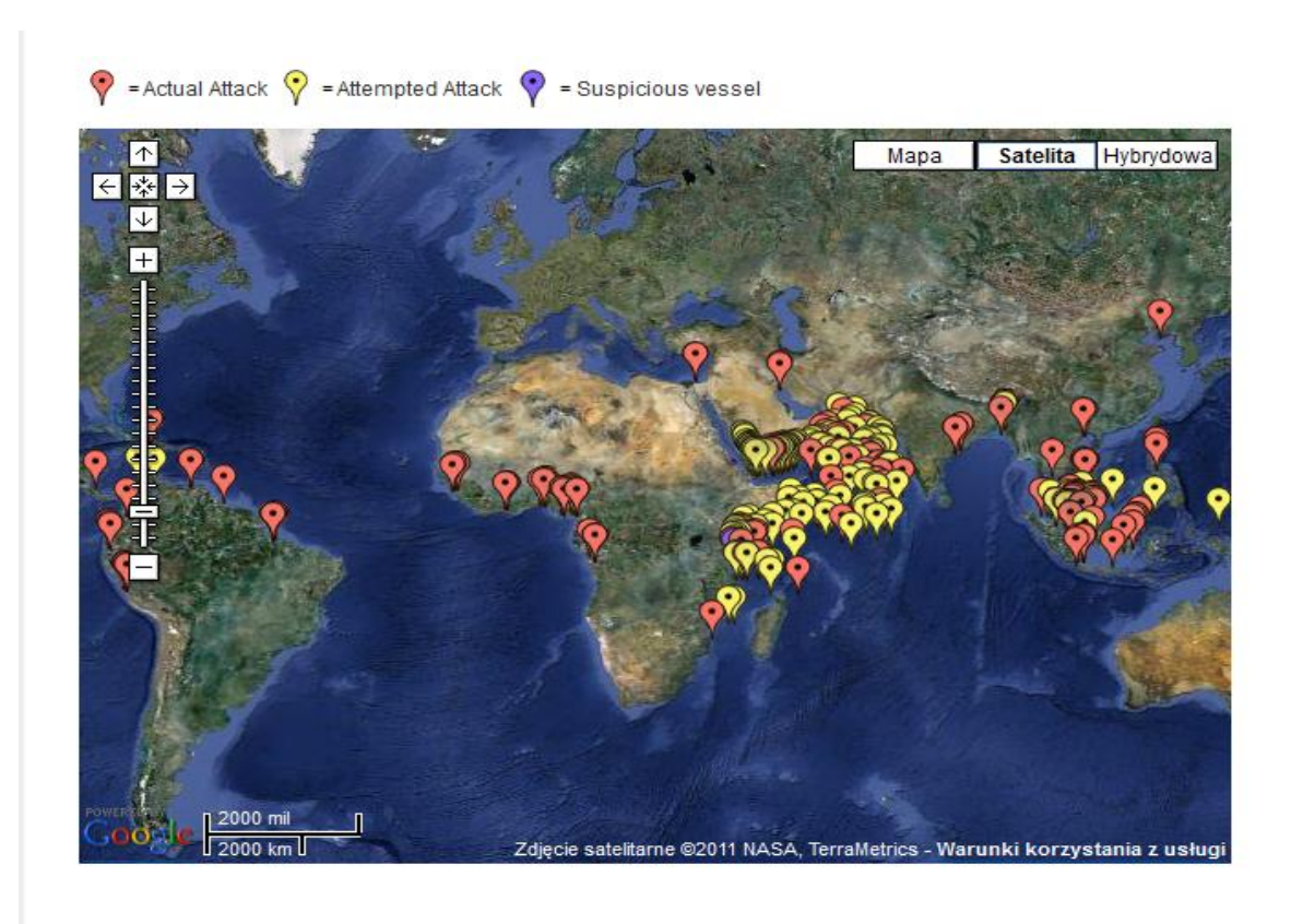
Fig. 2 IMB Piracy Map 2010

The risks are, as mentioned, diverse in nature, but some of them are particularly amazing today. While terrorism has become a daily part of news from the world, this activity seemed to be pirates - at least in Europe - something that irrevocably passed into history.